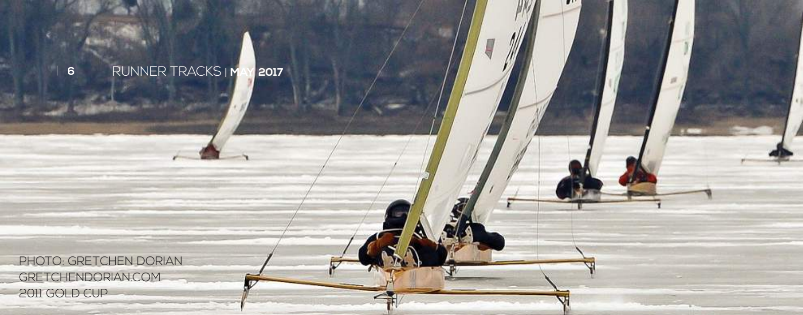
2011 GOLD CUP