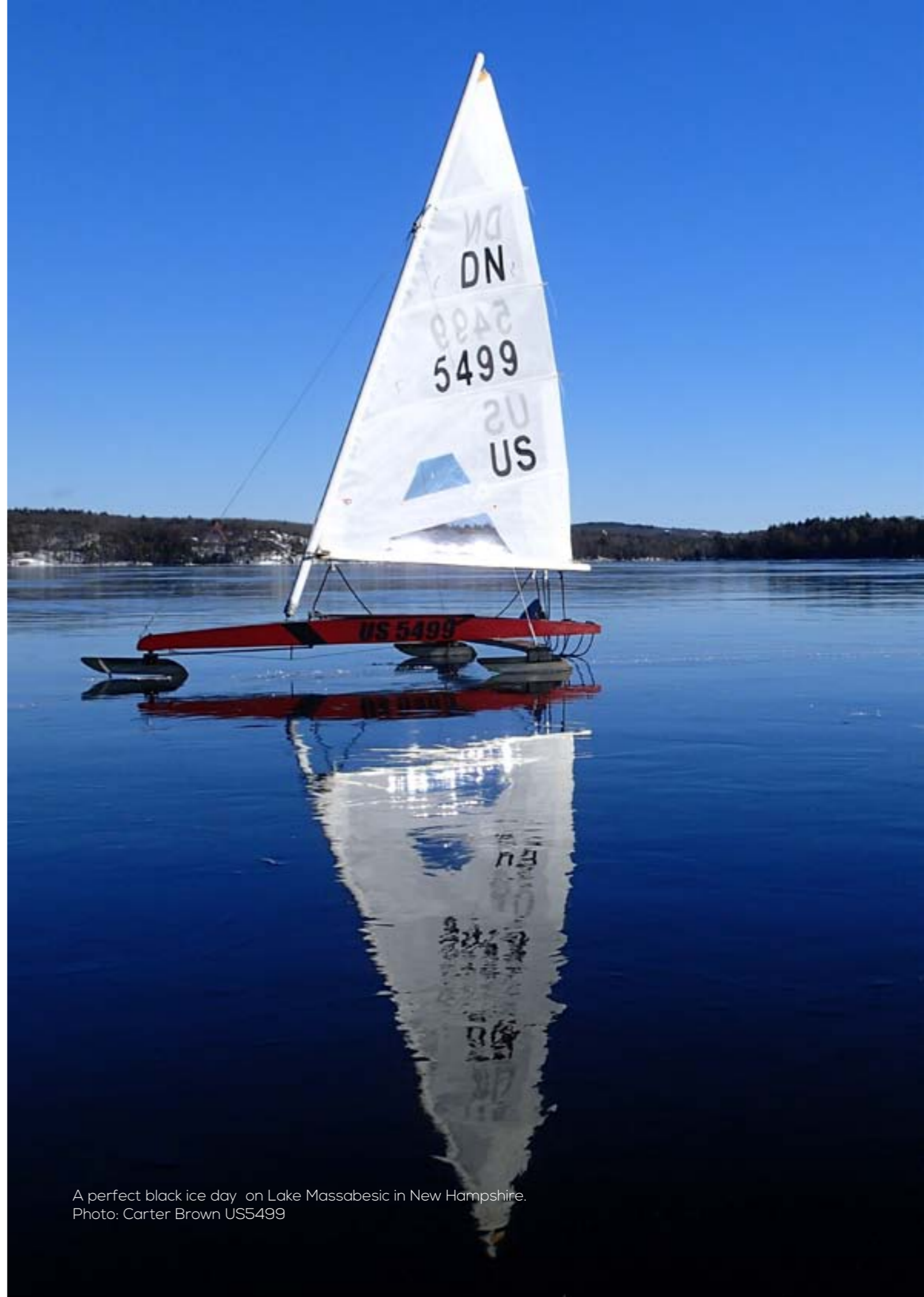
A perfect black ice day on Lake Massabesic in New Hampshire.