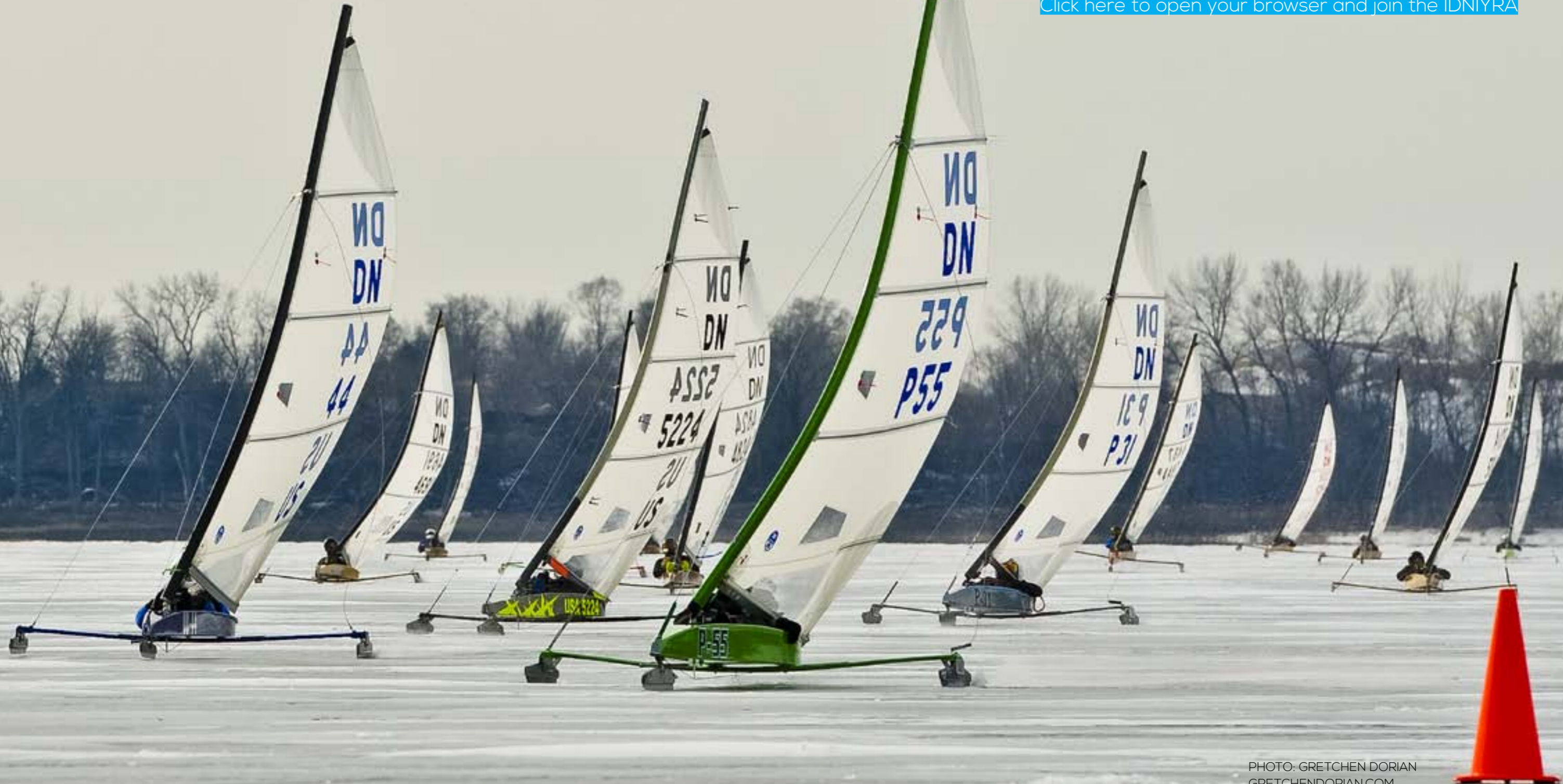
2011 GOLD CUP

Click here to open your browser and join the IDNIYRA