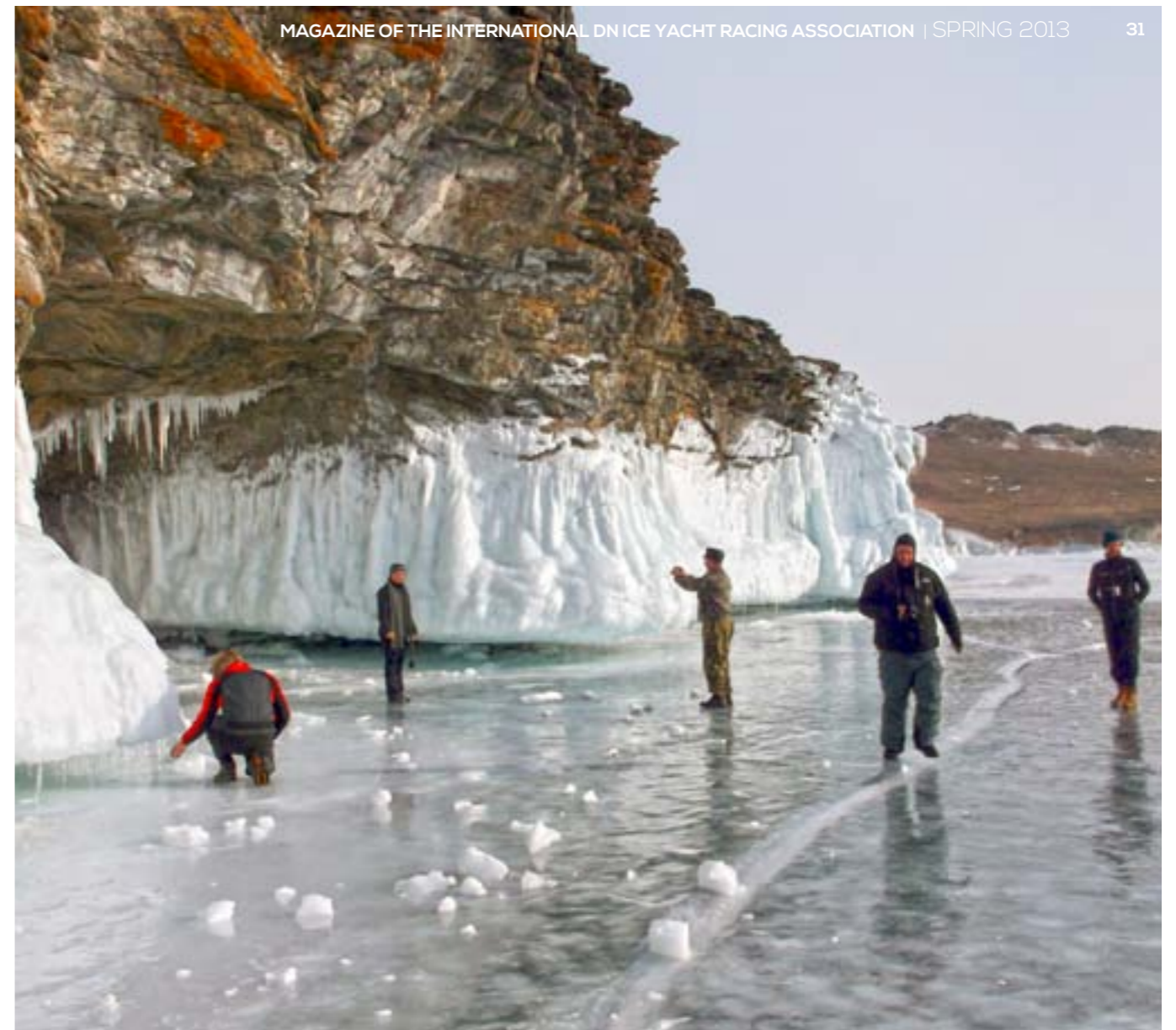
Visiting Baikal's ice caves via hovercraft tour that took us to the deepest part of the lake which is one mile deep.

A 27 foot high Buddhist stupa, considered to be offerings to deities, on the highest spot of Ogoy islet not far from the sailing area. This stupa is only one of two that exist in Russia and was built 2005.