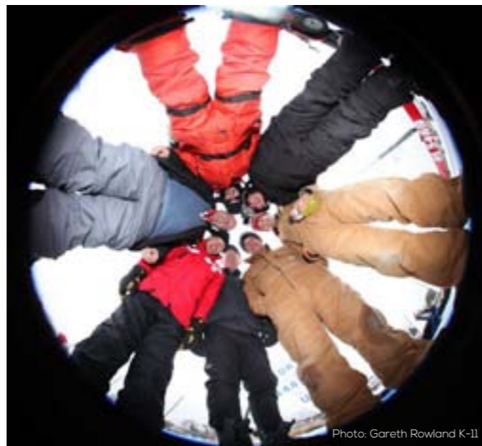
K-11

Tuesday afternoon would finally see us getting the required races in, and sailing until we ran out of time to complete the regatta. It was warm, and