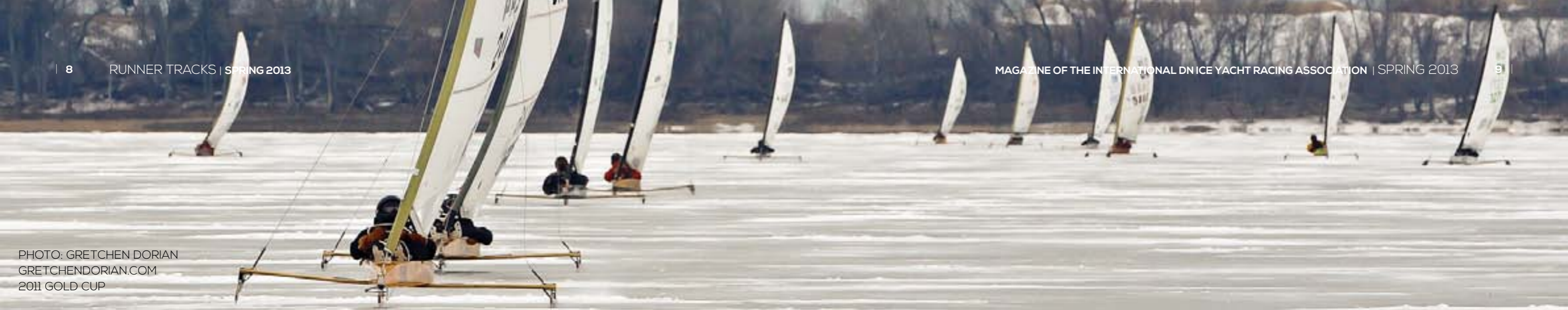
2011 GOLD CUP