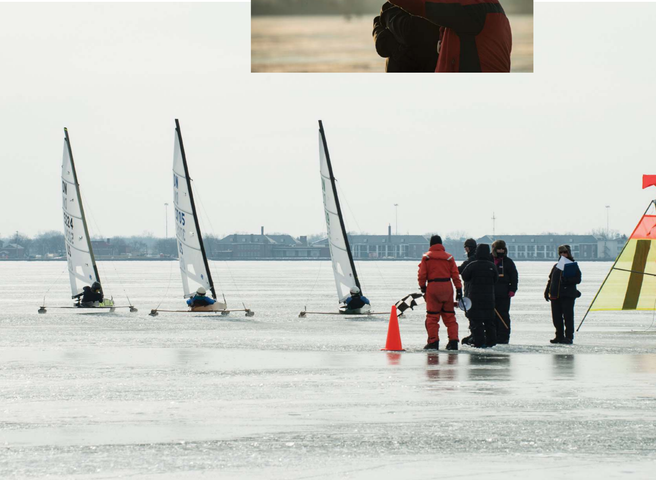
Bottom: The Race Committee watches the Gold Fleet start.