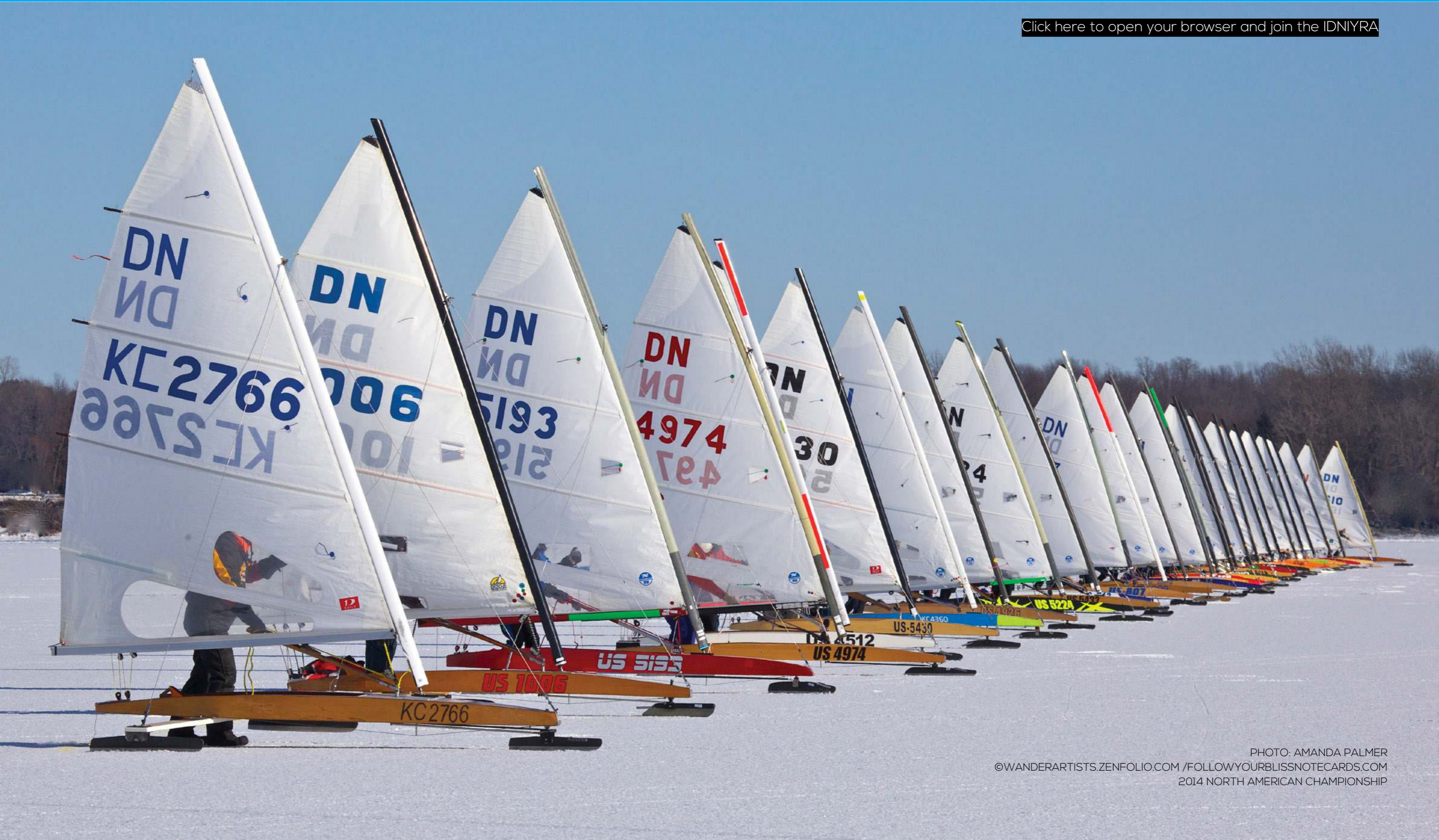
2014 NORTH AMERICAN CHAMPIONSHIP

Click here to open your browser and join the IDNIYRA