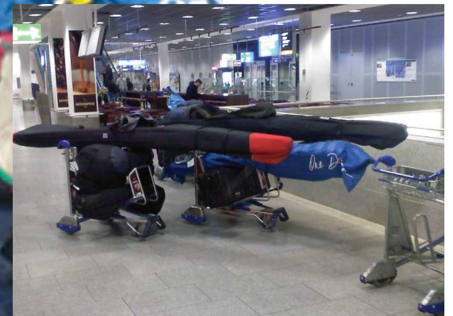
Right, two complete DNs on the SmartCart at the airport in Frankfurt, Germany