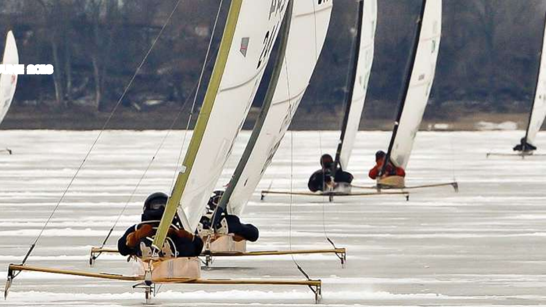
2011 GOLD CUP