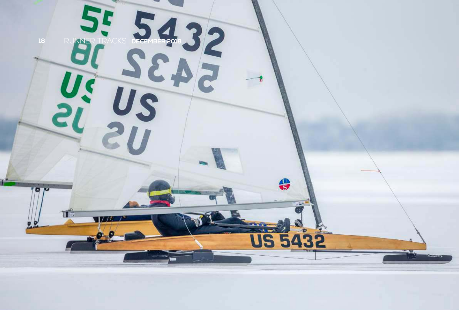
BATTLE LAKE, MN DECEMBER 1-2, 2018