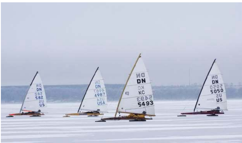
2018 Great Western Challenge