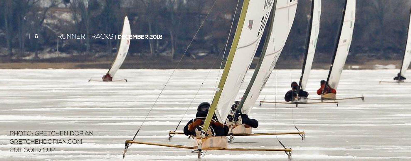
2011 GOLD CUP