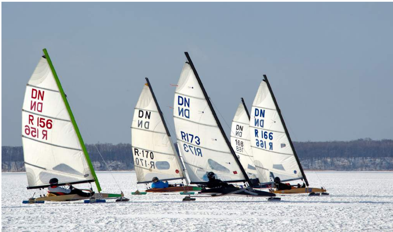
DNs on the Sea of Japan in Vladivostok, Russia.