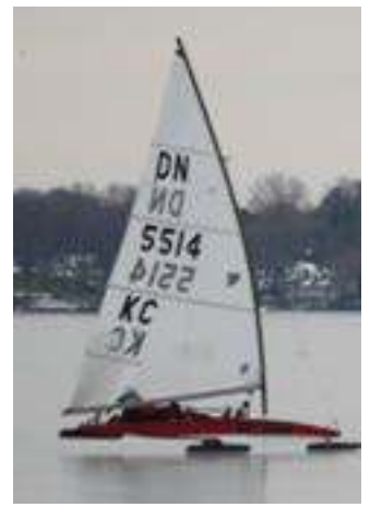
CANADIAN CHAMPIONSHIP TBA idniyra.org