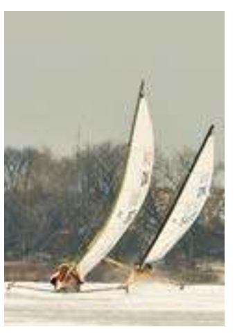
CENTRAL LAKES TBA