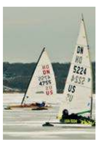
NEW ENGLAND CHAMPIONSHIPS TBA neiya.org