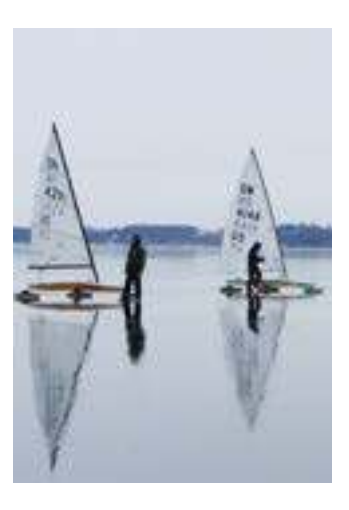
WESTERN LAKES December 31, 2022 -January 1, 2023 idniyra.org