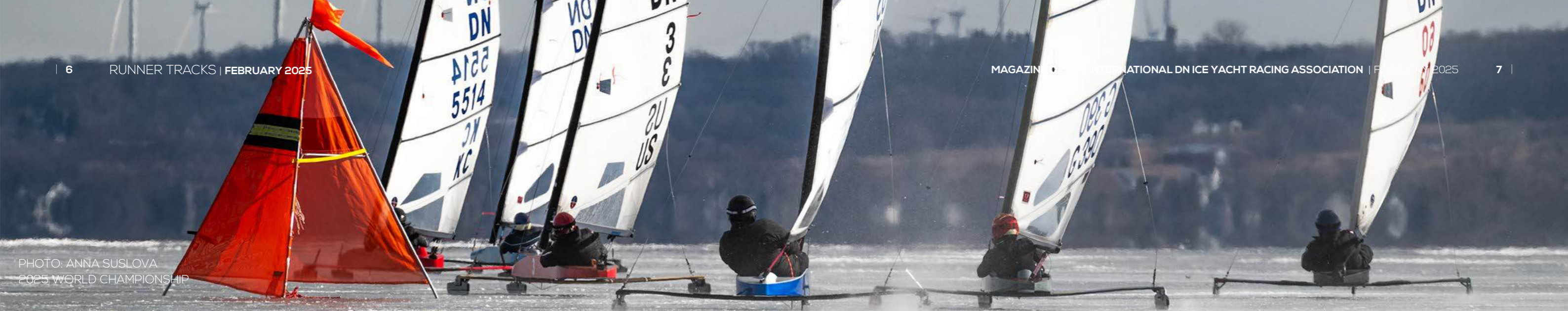
2025 WORLD CHAMPIONSHIP