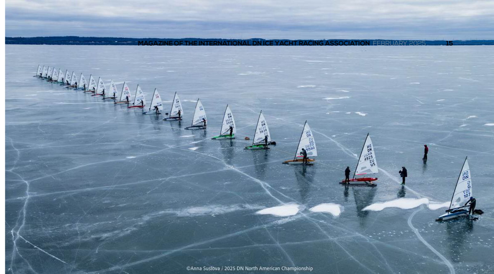
2025 DN North American Championship