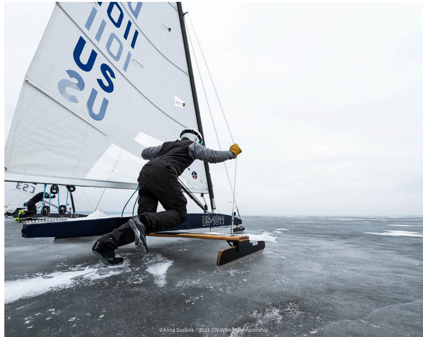
2025 DN World Championship